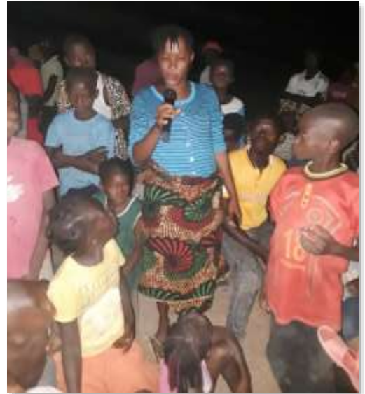
Taking part in the post-screening discussion

The PFP work in Sierra Leone was challenging and time consuming but ultimately successful as FVFG continues to learn and improve. Thanks to all the partners and supporters who have helped us in Sierra Leone over the past year, particularly The Welfare Society for the Disabled and Handicap International.