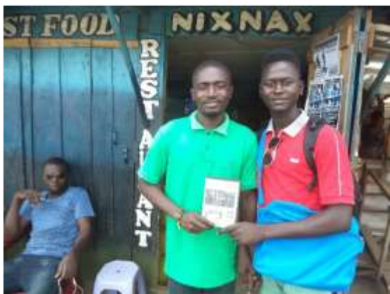
Me En You, One People arrives at a video shack