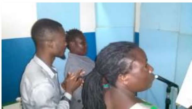
Hard at work in the recording studio

The completion of the dubbing and the successful launch of 'Chosadziwika' did take longer than we expected but we are most grateful to everyone who helped this project: The NGO Good Health Organisation and the many other volunteers and colleagues we met in Malawi.